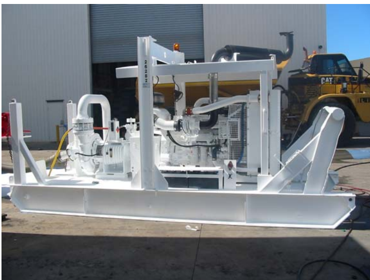
Ready to Ship