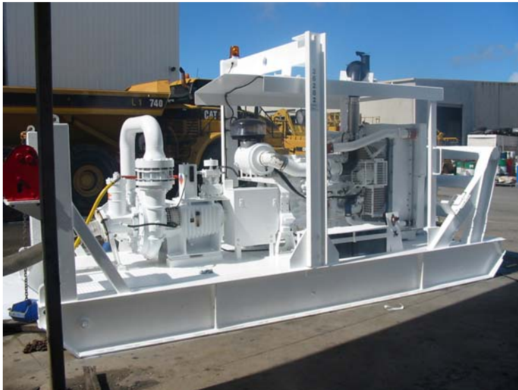
Ready to Ship