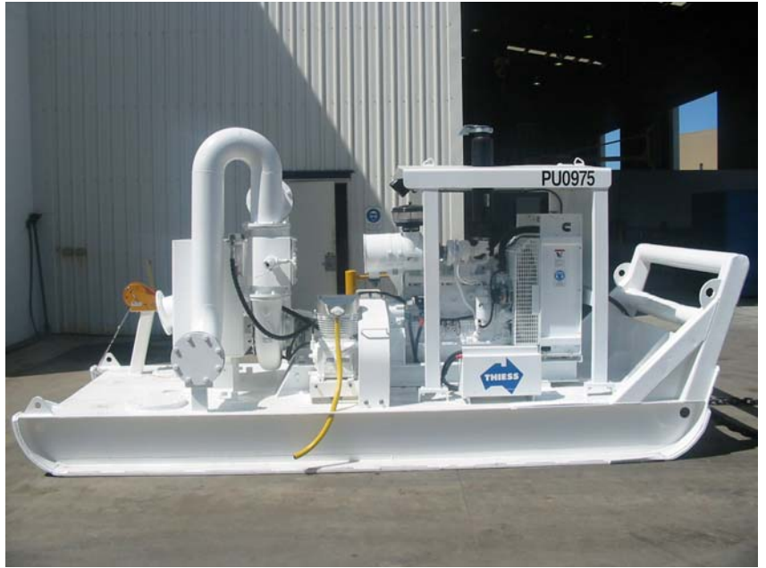
After Rebuild Multiflow 200S Pump Module.